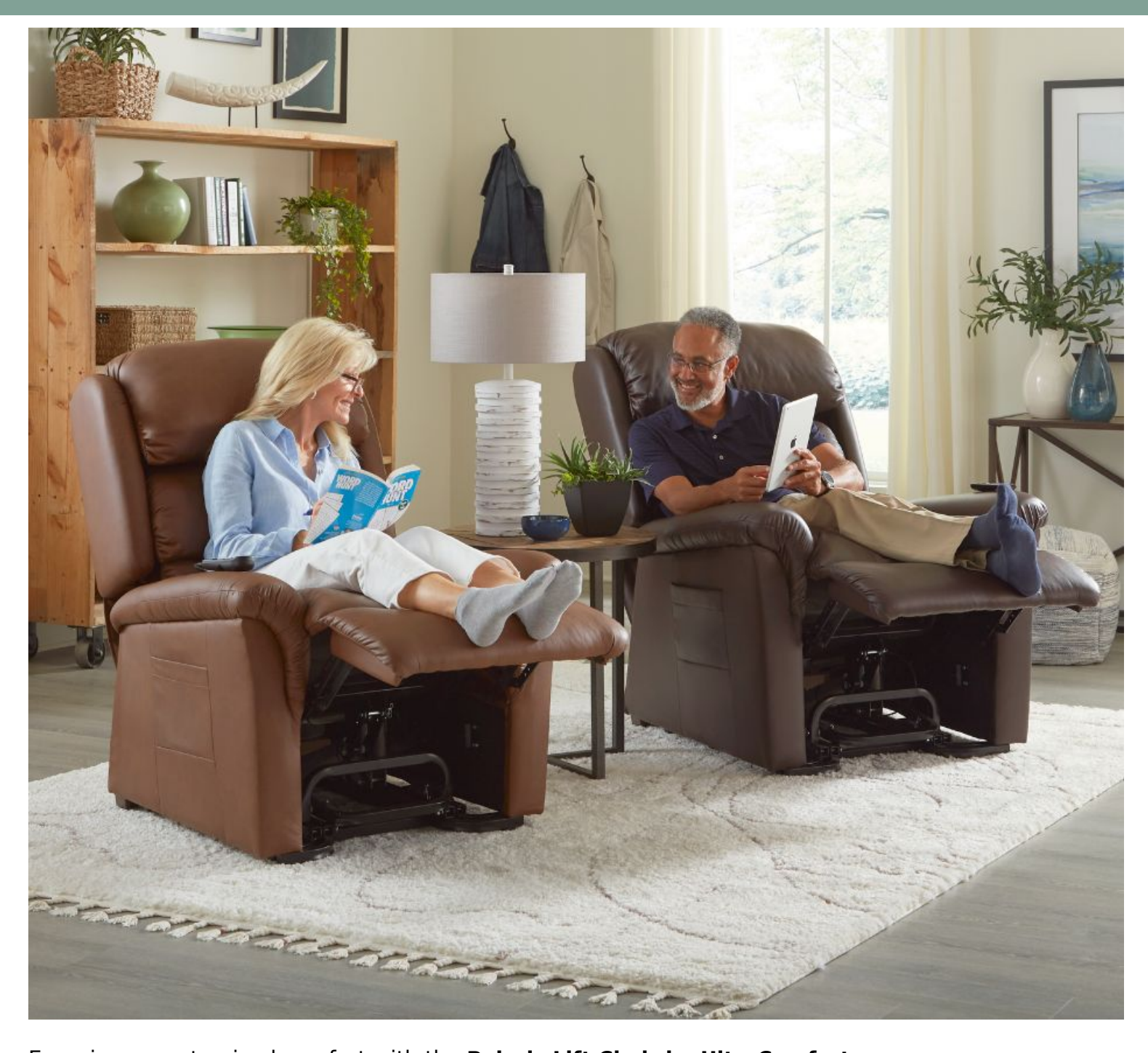
Experience customized comfort with the Polaris Lift Chair by UltraComfort.

This ergonomic power lift recliner offers a tailored pillow back for a clean, yet relaxed style while providing ideal support. The plush arms and extra wide chaise pad, along with four sizing options, provide hours of endless comfort for every individual.