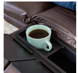
Drink Holder & Storage Compartment