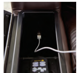
USB Charging Port & Storage Compartment