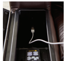
USB Charging Port & Storage Compartment