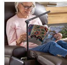
Removable LED Light