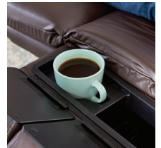
Drink Holder & Storage Compartment