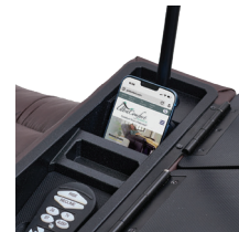
Wireless Phone Charger