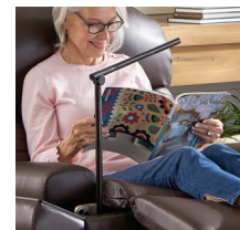
Removable LED Light