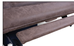
Footrest Extension Standard