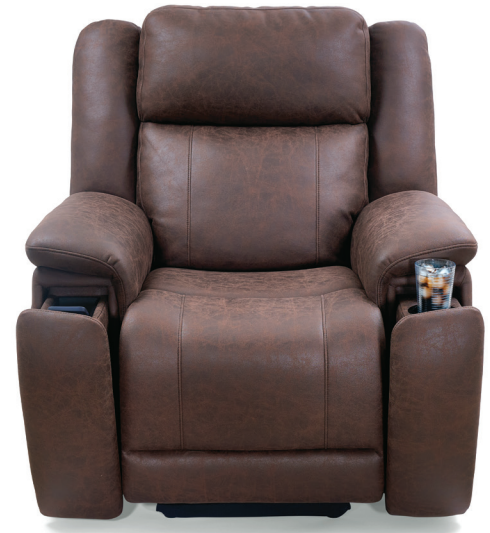
Front Load Open Arm Design