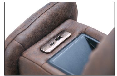
Dual USB-A/USB-C Port